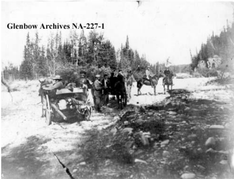
Glenbow Archives NA-227-1

1905 - Maurice Ingeveld arrives in Canada, and begins search in the Calgary area for ideal location for raising fine horses. Registers Double N Brand